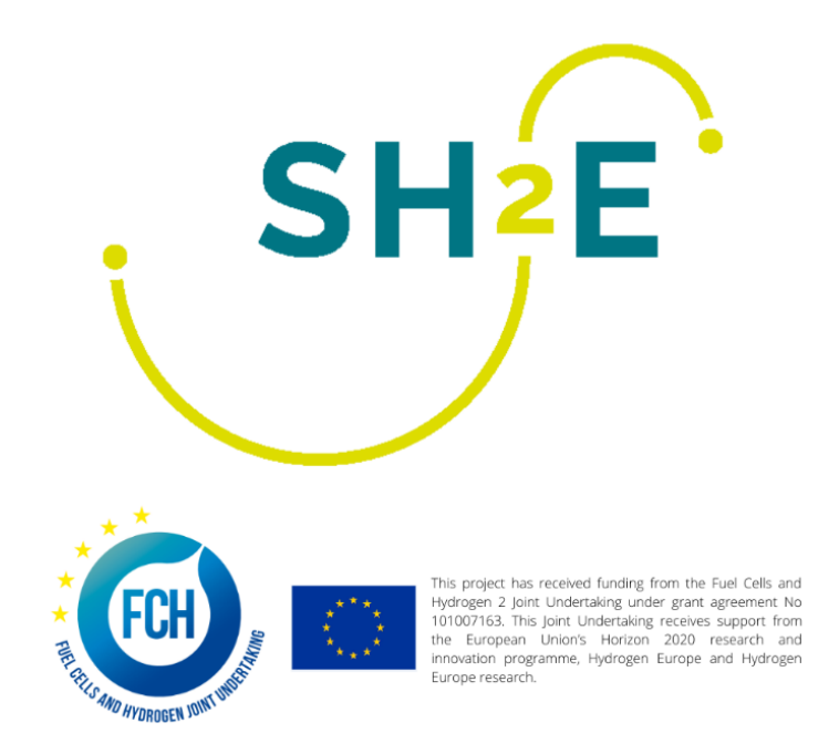
FIGURE 6 SH2E LOGO AND MANDATORY ACKNOWLEDGE

For social media, a combination of the project logo and the mandatory acknowledgement of the funding authority has been created (Figure 6):