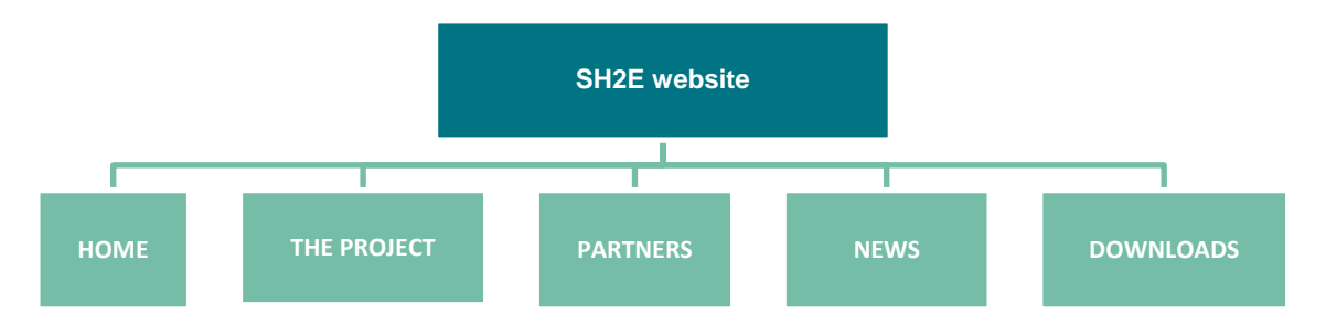
FIGURE 1 SH2E WEBSITE STRUCTURE

SH2E website will be simple and easy to navigate, with a map structure and content as follows (Figure 1):