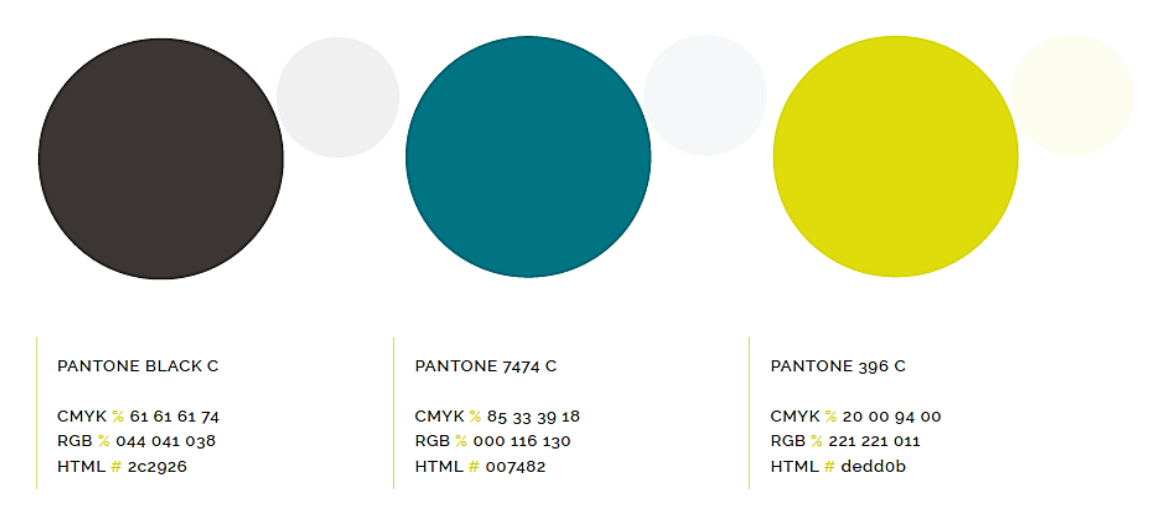
FIGURE 7 SH2E CODE OF COLOURS

The selected code of colours for SH2E visual identity is composed as shown in the following figure (Figure 7)