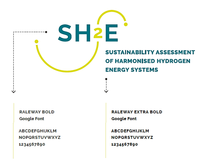
FIGURE 8 SH2E LOGO TYPOGRAPHY

The selected typography for the SH2E logo is the as presented below (Figure 8):